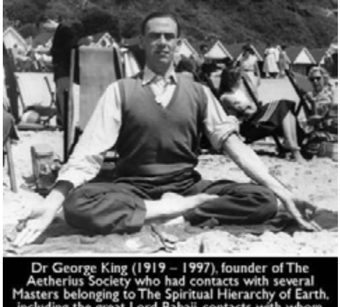
Aetherius Society who had contacts with several Masters belonging to The Spiritual Hierarchy of Earth including the great Lord Babaji contacts with whom are also reported in the Autobiography of a Yogi by Paramahansa Yogananda

The information given by and through him reveals what extraterrestrials are actually like, and how mankind on Earth can put right the problems we now face as a planetary race.